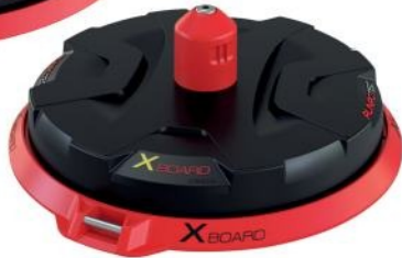
X Board Cable Roller XB300