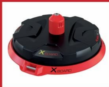
CABLE ROLLER SYSTEMS