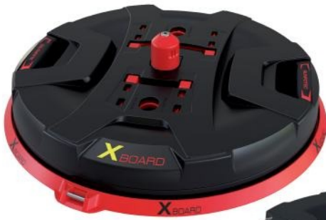
X Board Cable Roller XB500